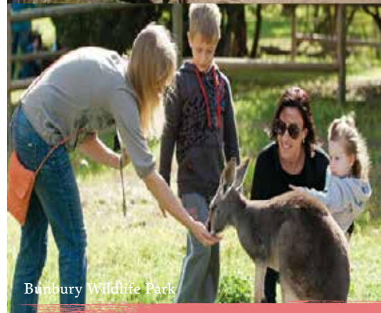
Bunbury Wildlife Park

Need more? Kids can also rollerskate or tenpin bowl in Bunbury