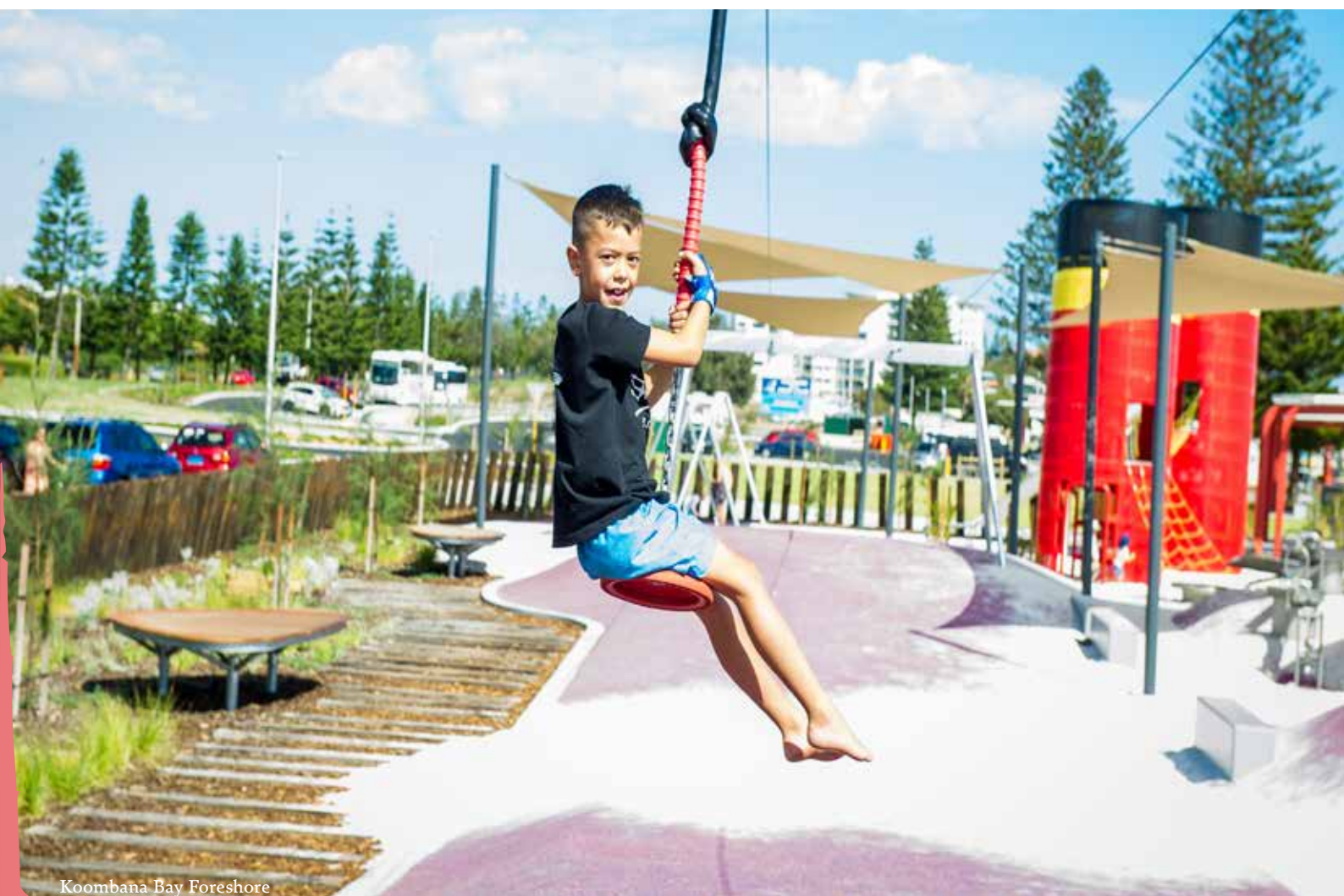
Koombana Bay Foreshore

Find activities that the whole family genuinely loves in #BunGeo!