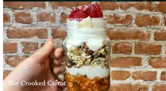
The Crooked Carrot

Harvey is Orange Country. Climb the Big Orange or pick up produce roadside in season. Surrounded by rich, irrigated plains on the banks of the Harvey River, Harvey is one of Australia's prime producing regions with a rich Italian heritage.