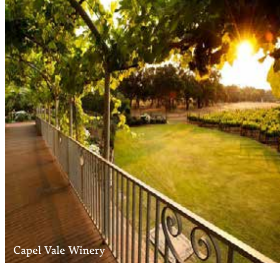
Capel Vale Winery

(ED Note: if visiting later in the day try the awesome views of the historic Parade Hotel or a gourmet burger from Paddy's Patties .)