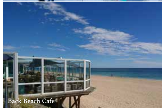
Back Beach Cafe