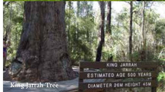
King Jarrah Tree

A trip to the very quirky Gnomesville in the Ferguson Valley is a must and will delight the little ones for hours!