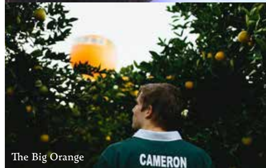
The Big Orange