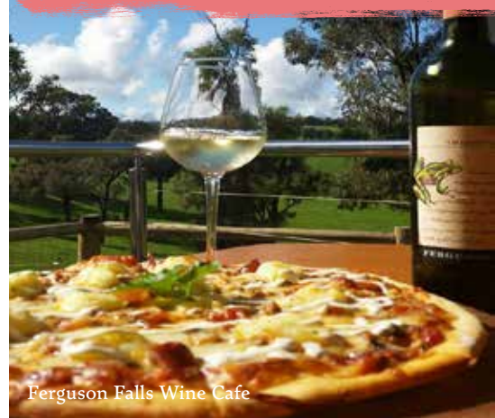
Ferguson Falls Wine Cafe

Want more quirky collections? Continue along Ferguson Road (it's one of the most scenic drives in WA) to the small locality of Lowden where you will find Frog Hollow and a collection of frog characters .