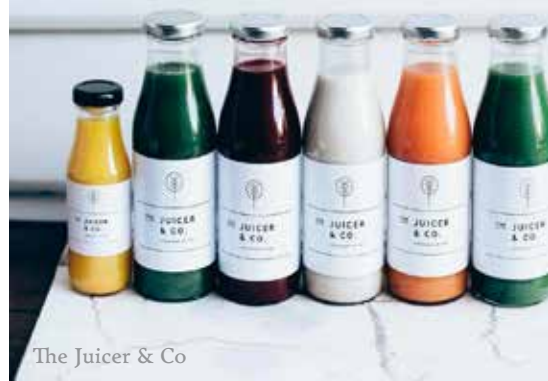
The Juicer & Co