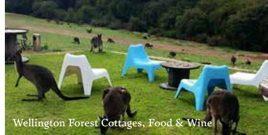
Wellington Forest Cottages, Food & Wine